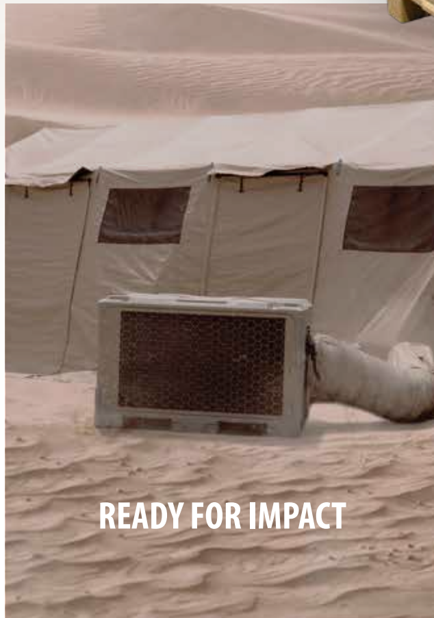
READY FOR IMPACT